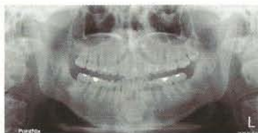
The panoramic image in previous time