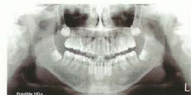
The panoramic image currently